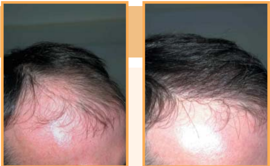
Robert from Yorkshire after one transplant session