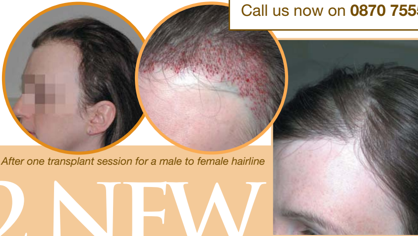
After one transplant session for a male to female hairline

We feel so strongly on the point of medicines that for all patients we are offering a free 6-month supply of either oral or topical medications with all surgery undertaken prior to June 1st, 2004. Call us now on 0870 7555 495 to find out more.